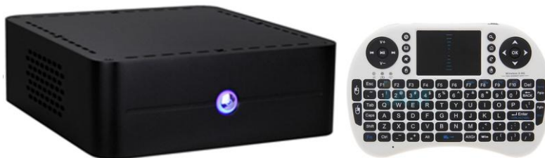
Mini WiFi gaming keyboard & new gaming console (both in proportion with the console being 6x20x22cm)

Here a quick update to where things are heading with our ShootingCinema technology. As you all know we are just in the final developing stages of the new gaming console/computer. All old units will be replaced by me (free of charge) once the new system arrives.